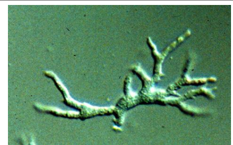
Trophozoite of B. mandrillaris in culture

Balamuthia can cause infections of the skin, sinuses, brain, or other organs. Infection can begin with a non-healing skin lesion and then progress to GAE. More than 89 percent of infections are fatal, however early identification of the disease and treatment increase survival. Both immunocompromised and immunocompetent people are at risk for infection and for progression to GAE.