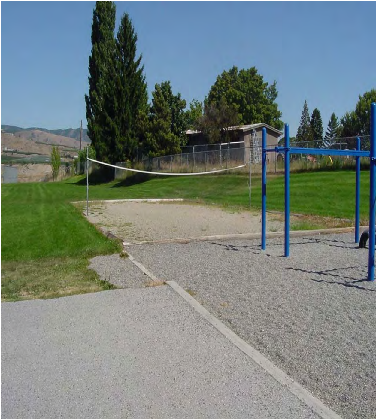
Figure 4. Manson playfields, Chelan Washington.