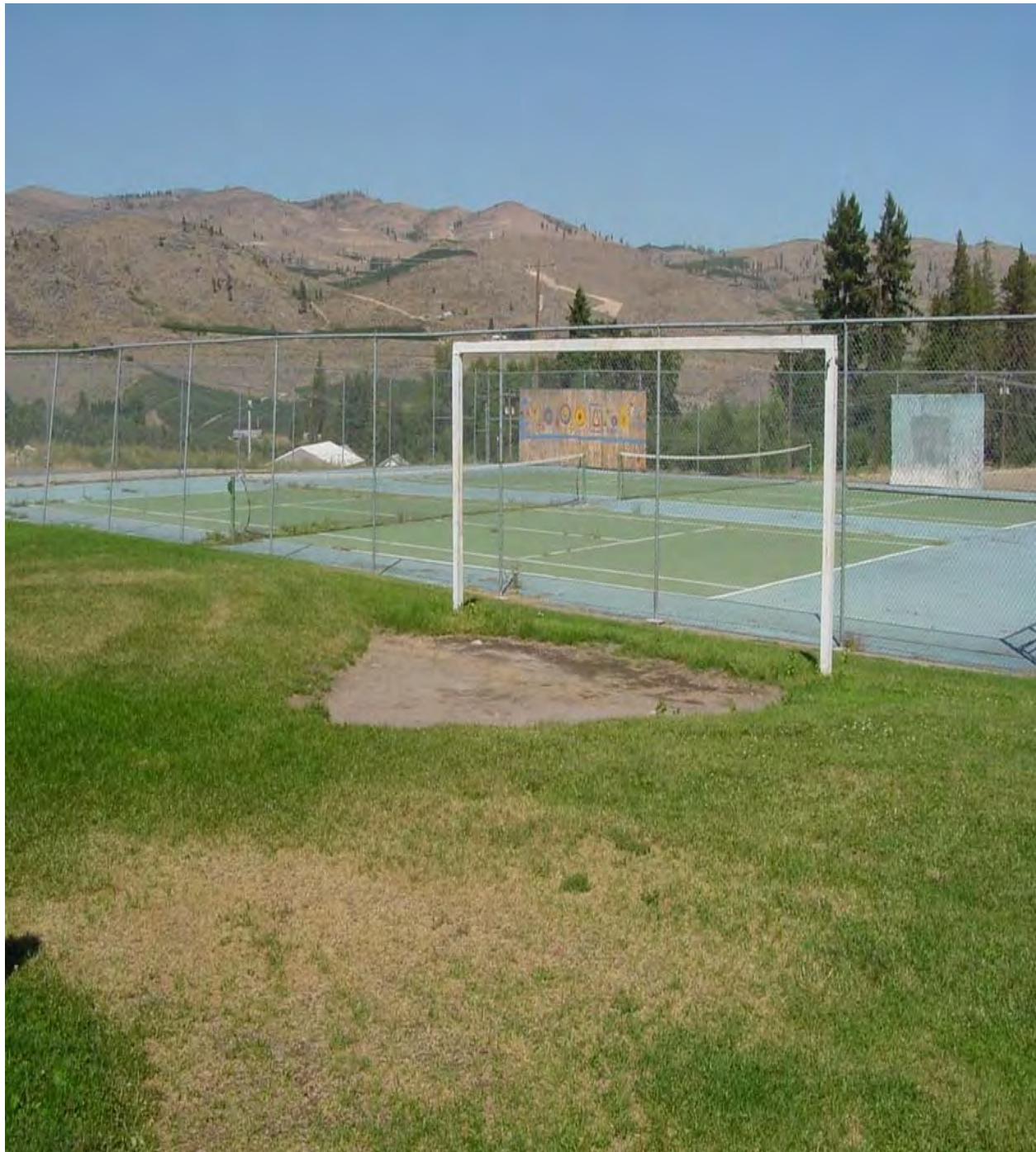
Figure 3. Manson soccer field Chelan, Washington.